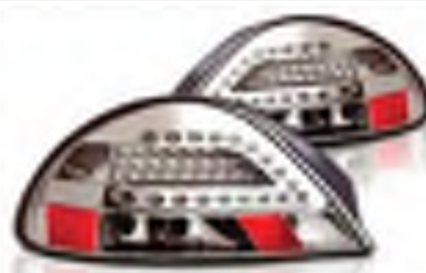
LED TAIL LIGHTS