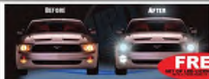
HID CONVERSION KITS