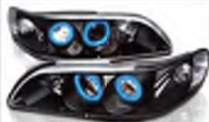
HID & LED HEADLIGHTS